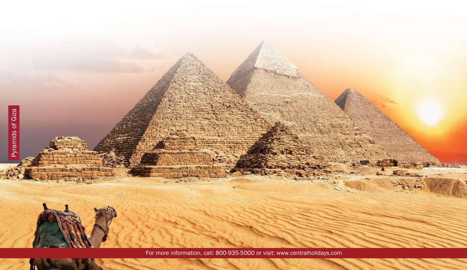
Pyramids of Giza